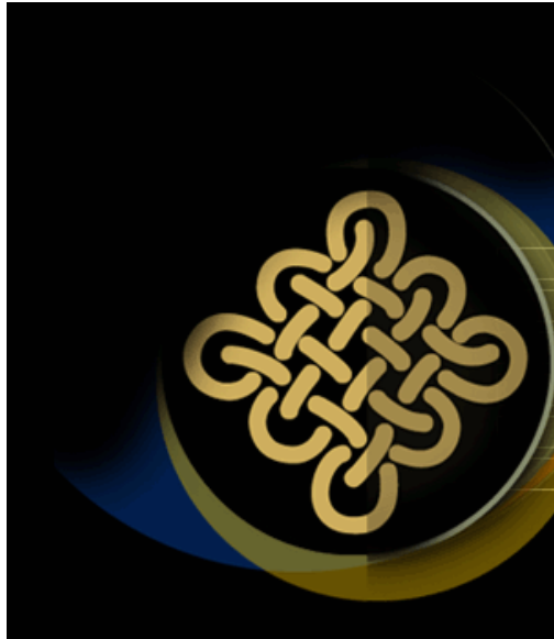
Korean American Museum