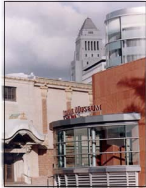
Japanese American National Museum