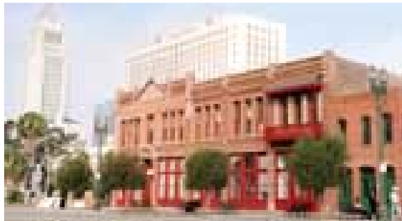
Chinese American Museum