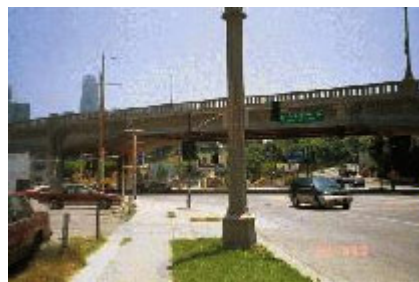
Figure 2 1st St. Bridge (a downtown skyscraper in background)

Driving through the major arteries of Historic Filipinotown, one can see the commercial vitality of the area and can get a feel for the different ethnic groups that are predominant there. Heading south on Glendale Blvd., just past Echo Park, we drive under the 101 Highway overpass and come upon the Temple St. and Glendale Blvd. intersection. To the right, on the northwest corner is a Chevron gasoline station. It is one of two gas stations that used to service that intersection. The gas station that used to be located on the southwest corner is now an empty lot. To left, on the northeast corner, are tennis courts, where Filipinos are known to occupy most, if not all courts on the weekends, especially during the morning and afternoon hours. Continuing south, we pass by a few auto shops and come to the end of the main portion of Glendale Blvd. and reach the point where the old, concrete 1st St. bridges connect to Beverly Boulevard (Figure 2).