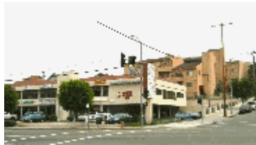
Figure 9 Luzon Plaza and Ramos Villages

Pollo Loco that just opened last week. This intersection was also the site of a horrifying accident about a decade ago. One afternoon, as a school bus full of children was eastbound on Temple, across from the McDonalds, a part protruding from a westbound city garbage truck that had suffered a mechanical failure, tore through the left side of the bus, injuring numerous children. Such a memory is emblazoned into the minds of those familiar with the area. Continuing east, we approach Bonnie Brae St. To the left is the Filipino owned Luzon Plaza and Ramos Villages (Figure 9). To the right is a Carnation factory from which sweet, warm aromas radiate.