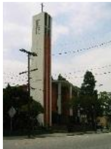
Figure 5 Our Lady of Loretto Church

To the right, north on Union Ave., is the fairly large Our Lady of Loretto parish (Figure 5) and elementary school (Figure 6), the closest parish to the sparkling new Cathedral of Our Lady of the Angels in Downtown L.A.