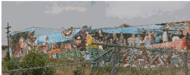
Figure 4 Filipino Mural Along Beverly Blvd.

the right is the United Firefighters of Los Angeles City headquarters. Continuing west, towards Union Ave., we come upon a Filipino mural to the left (Figure 4).