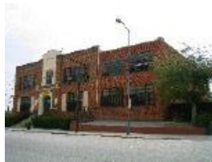
Figure 6 Our Lady of Loretto Elementary School

Back at the intersection of Union and Beverly, is a small Filipino restaurant on the southwest corner, Little Ongpin. A couple years ago, a driver lost control of his/her car and inadvertently drove into the restaurant one afternoon. Thankfully, no pedestrians on the sidewalk or patrons inside the restaurant were struck. Still heading west, we come upon Alvarado St. To the right, is a gas station on one corner, and a medical clinic housing several doctors and a pharmacy on the other. To the left, on the southwest corner is a plaza with a few stores including a Winchell's donut shop (Figure 7).