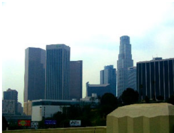
Figure 3 Shot of Downtown LA's Skyline from Atop the 1st St. Bridge

Just to the east of the bridges on 1st St., sits the troubled Belmont Learning Center. Turning right and heading west on Beverly Blvd., we drive up a rather steep incline — to the left (south) is the Belmont High School campus and to