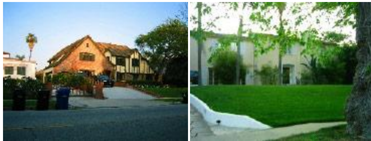
Figure 11 Housing in Hancock Park