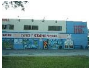
Figure 8 One of Several Ranch Markets in the Area

Just to the south of that intersection, at the next major intersection (3rd St. and Alvarado), is St. Vincent Hospital. Continuing west, we begin to see less of a Filipino presence and more of a Latino flavor. Before the next major intersection, on the left hand side, sits a one-story building that used to house a Filipino nightclub. Approaching Rampart Blvd., we see the "World Famous Tommy's Burgers" stand to the right. On the opposite corner is a Taco Bell. Further west on Beverly are a few Ranch markets (Figure 8) and several other small shops.