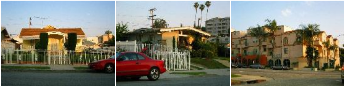
Figure 10 Housing in Historic Filipinotown

the national figure of 66%. The percent of renter occupied housing units in the area is a whopping 90%, compared to the city's figure of 61% and the nation's value of 33%. Such housing characteristics certainly reflect the visual contrast of Historic Filipinotown (Figure 10) to other districts in the Greater Los Angeles area such as Hancock Park (Figure 11) and Alhambra.