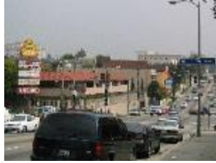
Figure 7 Intersection of Beverly Blvd. and Alvarado St.

Just to the south of that intersection, at the next major intersection (3rd St. and Alvarado), is St. Vincent Hospital. Continuing west, we begin to see less of a Filipino presence and more of a Latino flavor. Before the next major intersection, on the left hand side, sits a one-story building that used to house a Filipino nightclub. Approaching Rampart Blvd., we see the "World Famous Tommy's Burgers" stand to the right. On the opposite corner is a Taco Bell. Further west on Beverly are a few Ranch markets (Figure 8) and several other small shops.